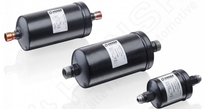
Symbolfoto / Placeholder