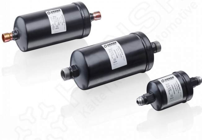
Symbolfoto / Placeholder