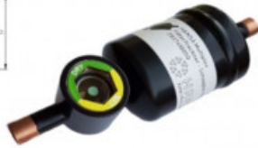
HANSA Artikeliste Multiplex - Kombis Lötanschluss